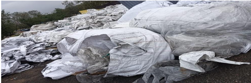
15. PLASTIC SCRAP, BAGS, TORN BAGS & CEMENT BAGS