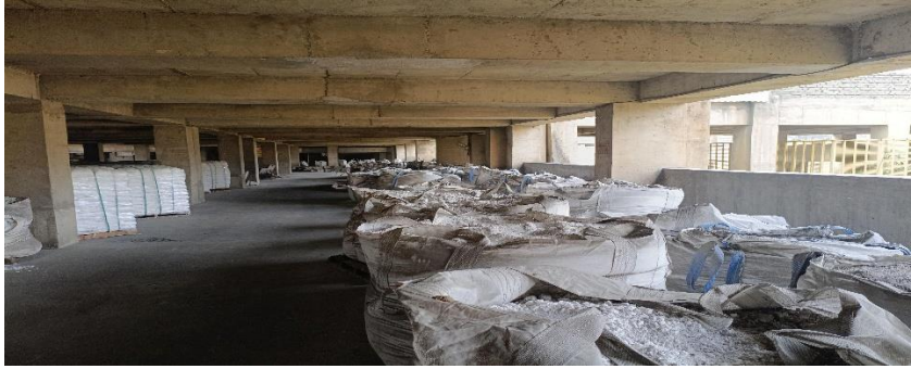
11. RECTIFIER ITEM'S(CT,PT INSULATOR,CB,ETC)