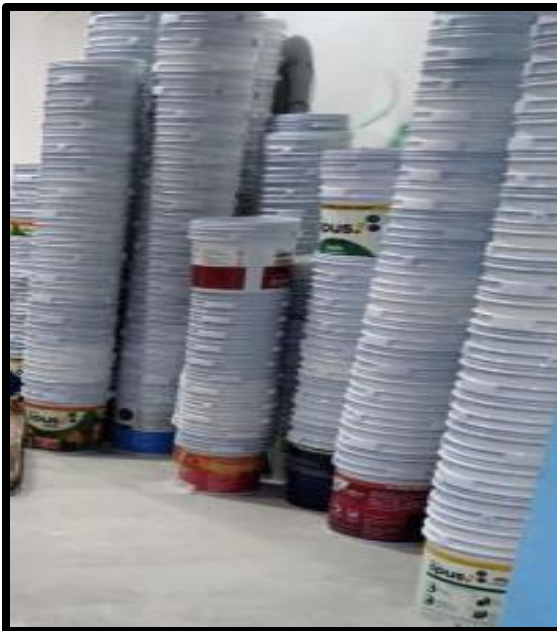
Non- Contaminated Plastic Pails Shredded through Vendor