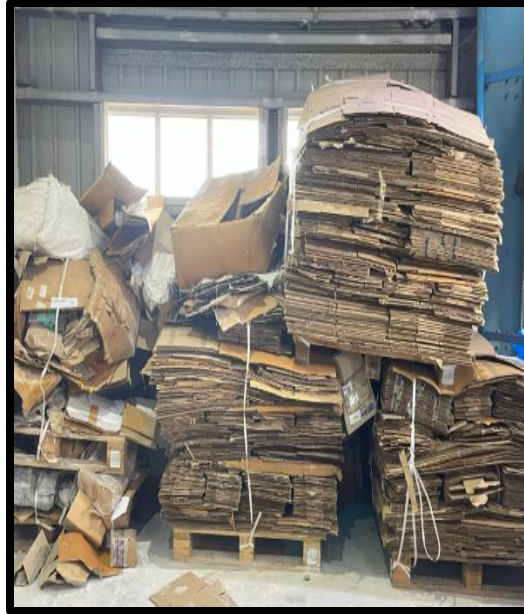
Non-Contaminated Corrugated Box