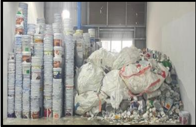
Contaminated Plastic Pails shredding through vendor