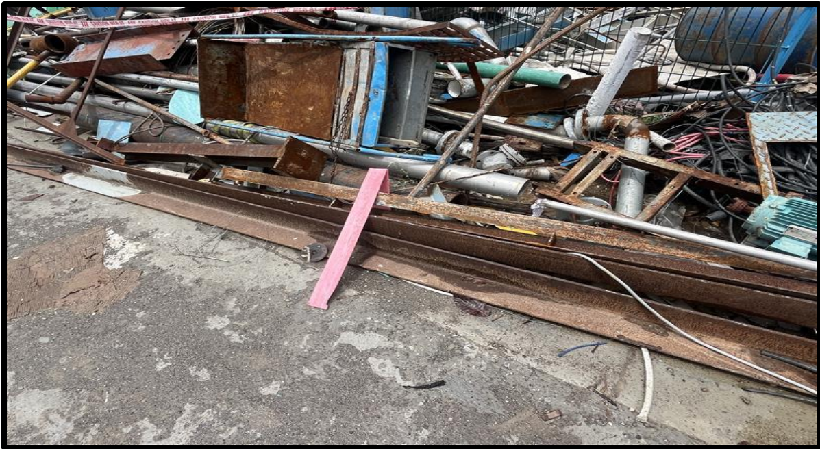
MS Scrap Light