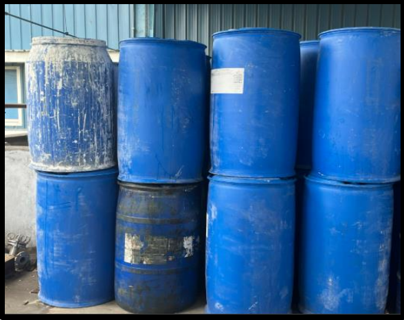
Hazardous 200ltr. Plastic Barrels