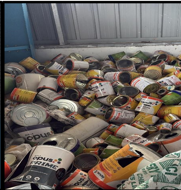
Non- Contaminated Metals Pails Shredded through Vendor