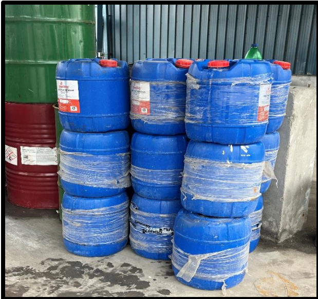
Hazardous 20/25 & 50 Ltr. Plastic Drum