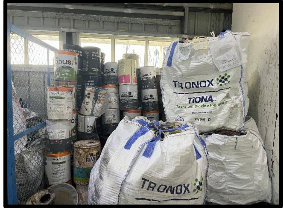
Contaminated Metals Pails shredding through vendor