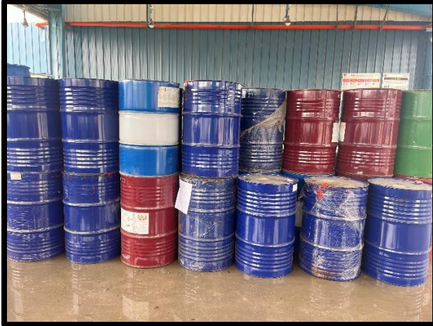
Hazardous 200ltr. Metals Barrels