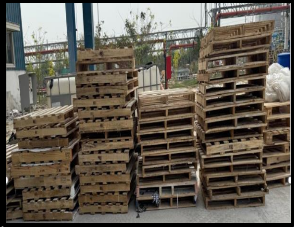
Wooden Retiles Pallets