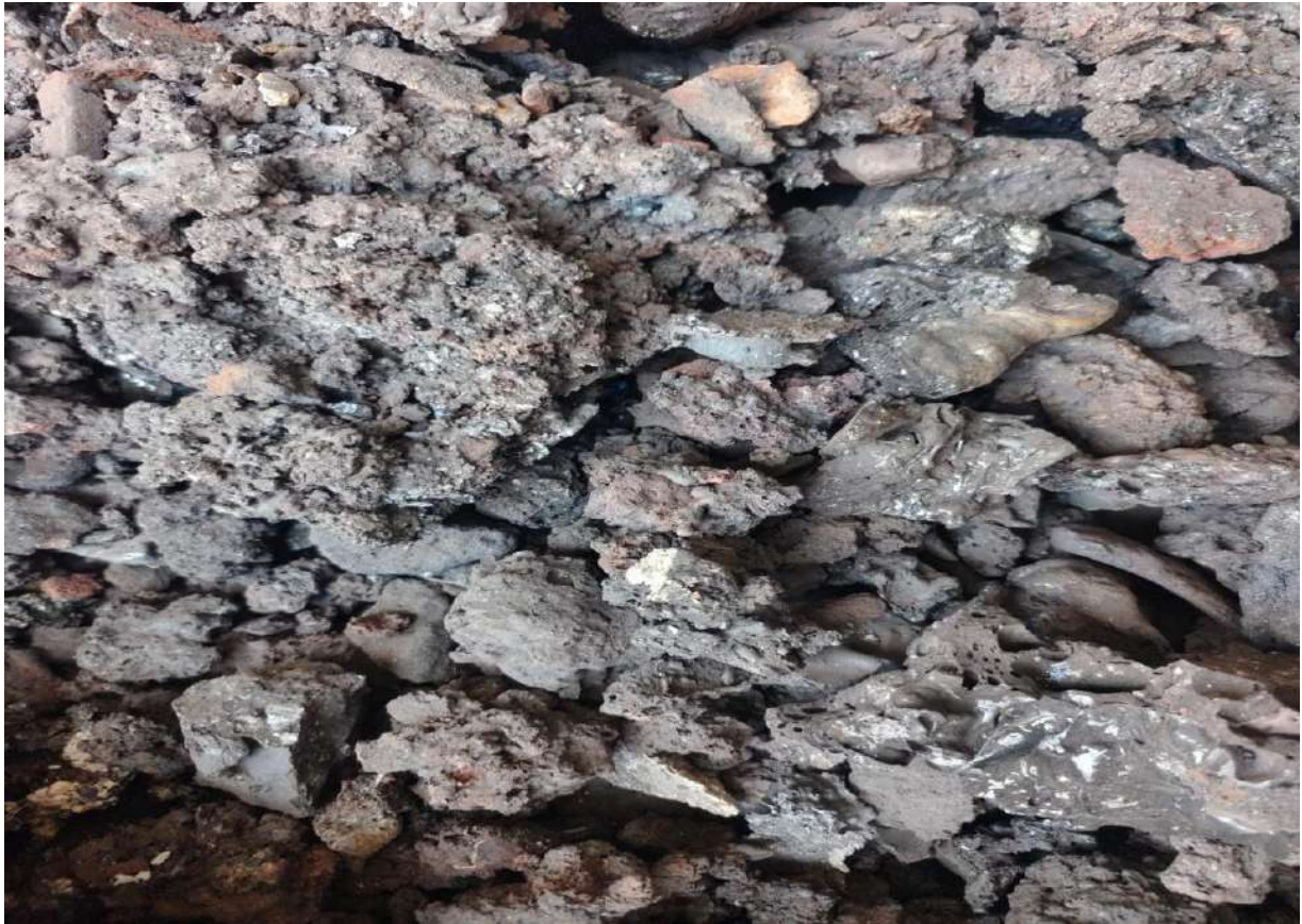
LOT No – 7 ( SCRAP CERAMIC - FILTER, ENGROSSED WITH ALUMINIUM METAL – 15 MT)